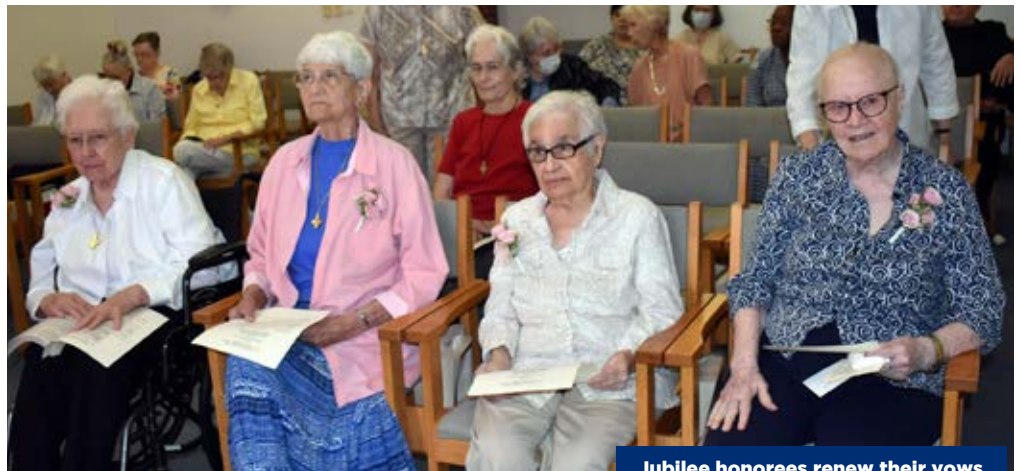
Jubilee honorees renew their vows