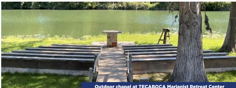
Outdoor chapel at TECABOCA Marianist Retreat Center